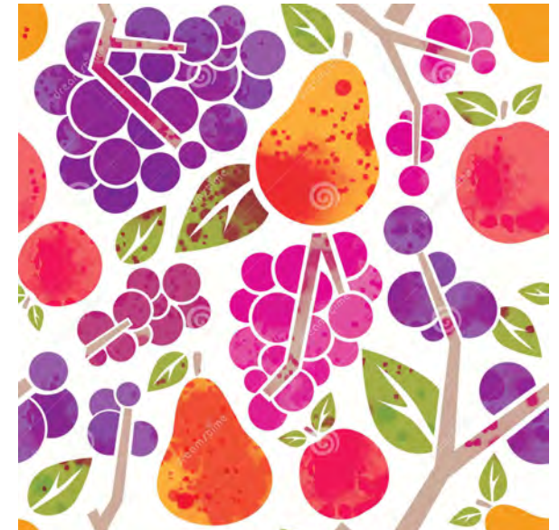
Illustration - nature, colourful, fun, quirky